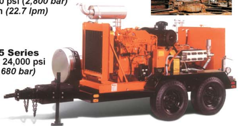
225 Series upto 24,000 psi (1,680 bar)